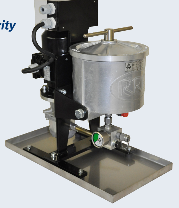
SE100E-BH with optional leakage tray